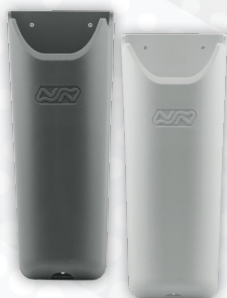
Winch Handle Pocket, PVC