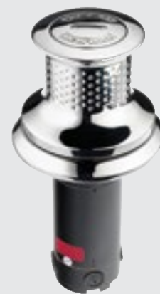
C3 Deck Unit and Motor Gearbox Assembly